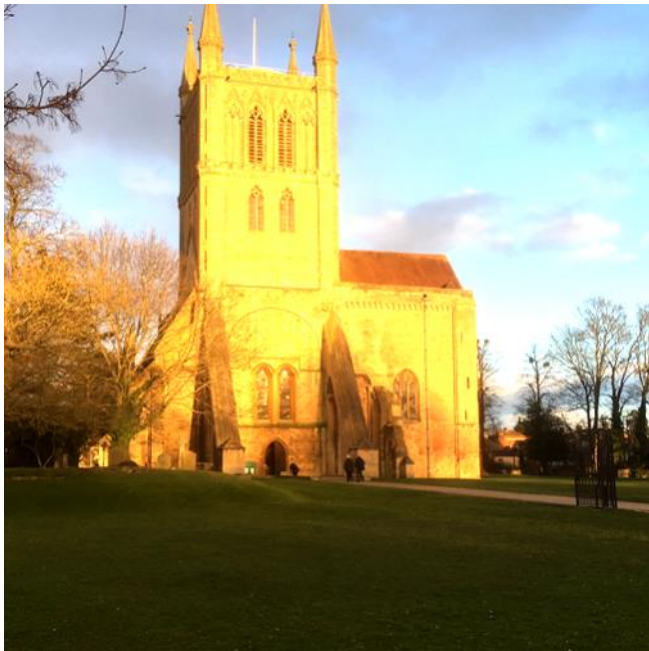
Pershore Abbey : Wholeness and Healing 11th February 2018

To know Jesus better, And to make Him better known