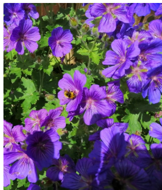
Hardy Geranium and Tree Bumble Bee

In the meantime we also continue to investigate how we might have a tree in the grounds of our church, how we might support planting initiatives in Broadway Village and elsewhere.